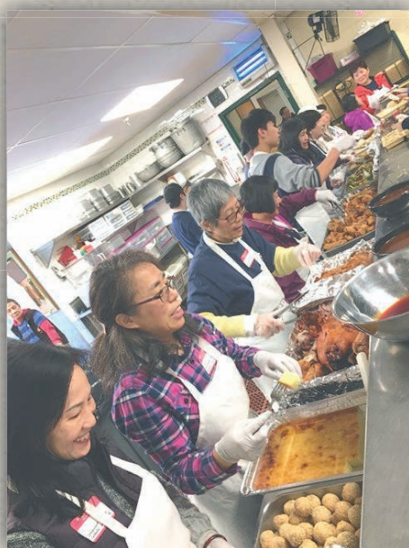
義工分發午餐 Volunteers serving lunch