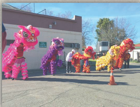
舞獅 Lion Dance