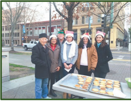
Pictures: This Christmas we had the "five days leading up to Christmas" and each BBL team hosted a daily Christmas celebration that included coffee, hot chocolate, cookies, pies, etc. We had a dad and his four kids bring Christmas gifts of socks, gloves, scarves. It really was a lot of fun. Bottom picture: Typical morning with our guests lining up for their lunch. 99 percent of the time everything is calm, peaceful and orderly. They come whether it's torrential rain, freezing cold, or horribly hot.

In 2017, this ministry distributed 20,000 lunches to our downtown brothers and sisters suffering from hunger. Twenty-five on-site volunteers distribute donated bagged lunches from Tuesday through Friday, 8:00 am to 9:00 am, to an average of 120 guests every day . For many of our guests, it is the only meal they will have all day long. Volunteers also offer whatever kind words and encouragement they can. And prayers are always available!