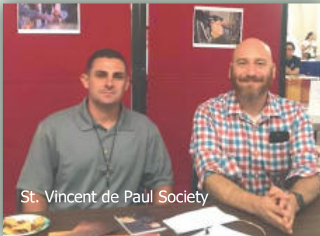
St. Vincent de Paul Society