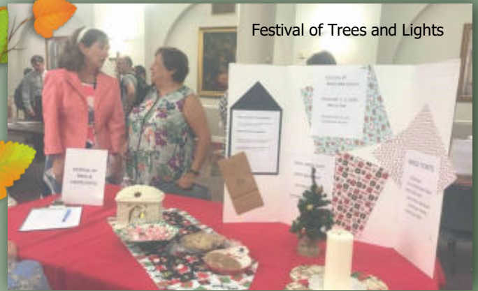
Festival of Trees and Lights