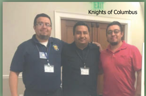
Knights of Columbus

Cathedral Ministry Fair 9-23-18