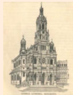
Eglise de la Trinité