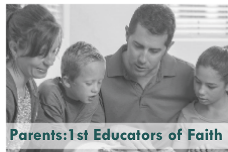
Parents: 1st Educators of Faith

La inscripción en línea para la formación de fe familiar comenzada. Vea el sitio web de la Catedral para más detalles.