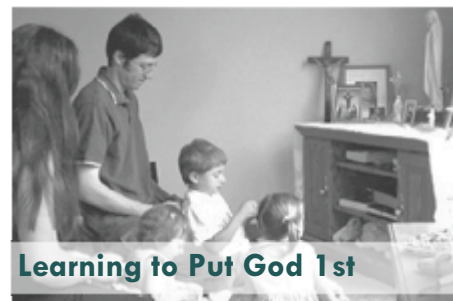
Learning to Put God 1st