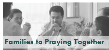
Families to Praying Together

Prepare for Sunday Mass nuestra lección familiar semanal con Niños Valientes https://is.gd/oracionfamiliar our weekly family lesson with Courageous Kids: https://is.gd/FamilyPrayer