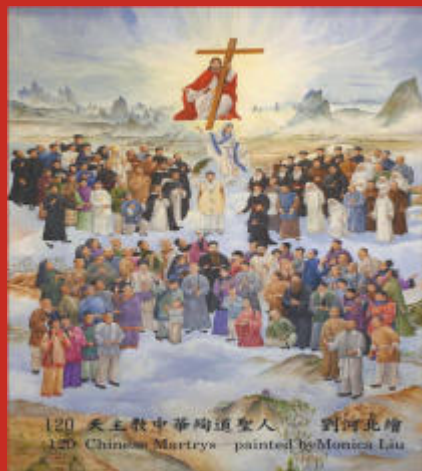
七月九日中華殉道諸聖節 Chinese Martyrs, memorial on July 9th

當我還是個孩子的時候，我母親有一組類似三個人頭的雕像，一隻手摀住耳朵，一隻手摀住眼睛，一隻手摀住嘴。然後有句格言這樣描述：聽不到邪惡，看不到邪惡，不說邪惡。從那以後，這些意像常常反覆出現，通常那圖像是日本成語裡的猴子頭，當時我還很小，這意像對我來說不覺得那麼可怕。顯然，對於這三個圖像或所描述的意象，並沒有一確定的共識，但至少，它使我們反思，我們需要避免邪惡的事物，並尋求事物中的美好。